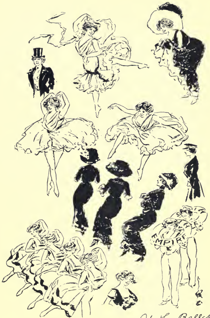
At the Ballet